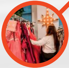
Pop-Up Prom Shop